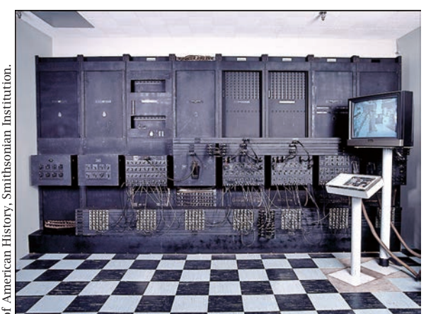
Figure 2. The ENIAC in the Smithsonian's National Museum of American History.

Division of Medicine & Science, National Museum of American History, Smithsonian Institution.