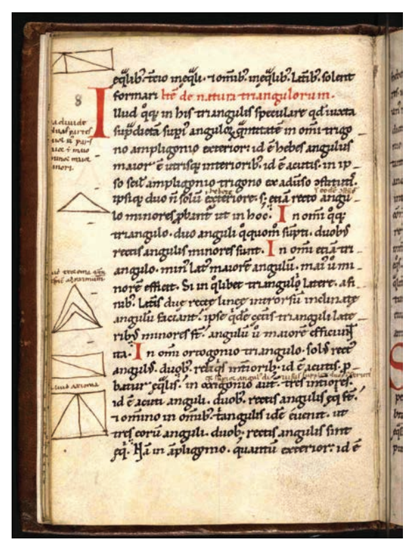
Figure 1. Excerpt from De Geometria by Pope Sylvester II (reigned 999–1003 CE).

The culmination of these feats was a computation of \pi using (2) to 527 digits in 1853 by William Shanks,